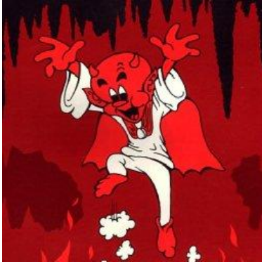
FIGURE 12: NEBBISK OH'S PHOTO FOR ASCENSION

“You can choose the curtain or what Carol Merrill has in the box on the table.”