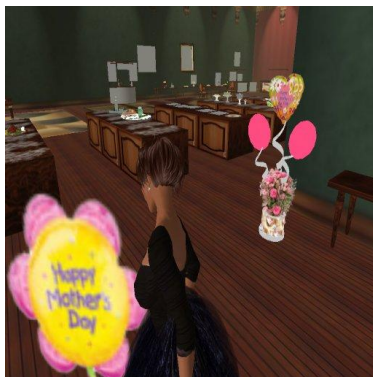
FIGURE 6: SKYE SODERSTROM'S PHOTO FOR MOTHER'S DAY