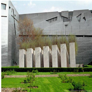
FIGURE 13: MALACHI BABENCO'S PHOTO FOR INTERNATIONAL MUSEUM DAY

Collections, of artifacts and documentations of now and then. Fixed within walls of glass cases and signs. Covered walls, bolted doors, and ironed bars magnify the knowledge these walls hold within.