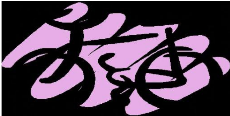
FIGURE 9: NEBBISK OH'S PHOTO FOR NATIONAL BIKE MONTH