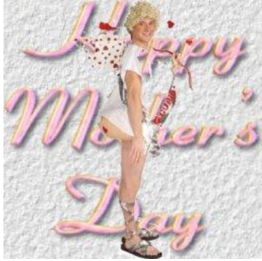
FIGURE 7: NEBBISK OH'S PHOTO FOR MOTHER'S DAY