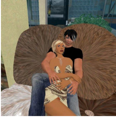
FIGURE 14: NEBBISK OH'S PHOTO FOR LIMERICKS

A woman in a flexi-prim dress, sought to gesture a sloppy /blowkiss. But she /repulsed instead TPed home and then said, "My inventory's too big a mess!"