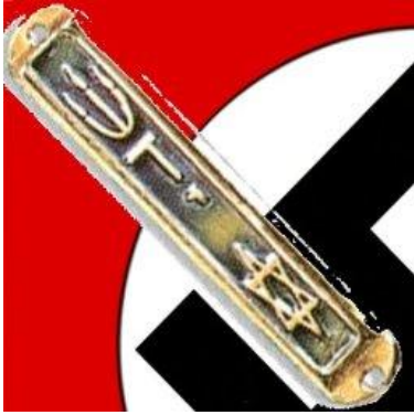
FIGURE 3: NEBBISK OH'S PHOTO FOR V-E DAY