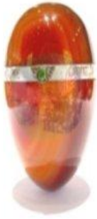
FIGURE 10: NEBBISK OH'S PHOTO FOR NATIONAL EGG MONTH