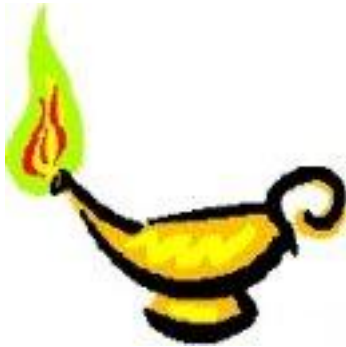
FIGURE 2: NEBBISK OH'S PHOTO FOR CORRECT POSTURE MONTH